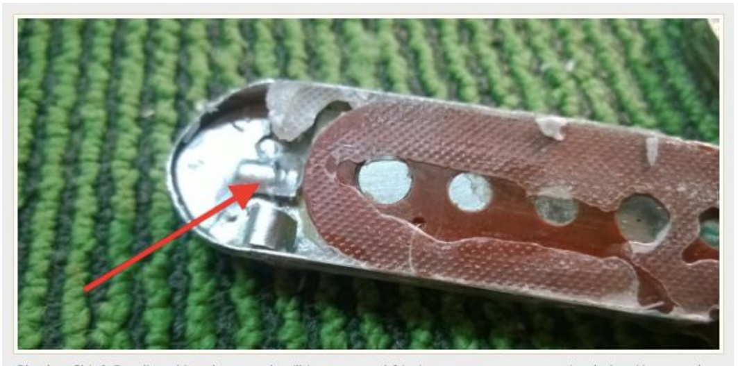
Rhythm Chief: Bending this tab upward will increase rod friction on worn-out mounting holes. You can do this without opening the pickup with a small flathead screwdriver (such as the kind for repairing eyeglasses)